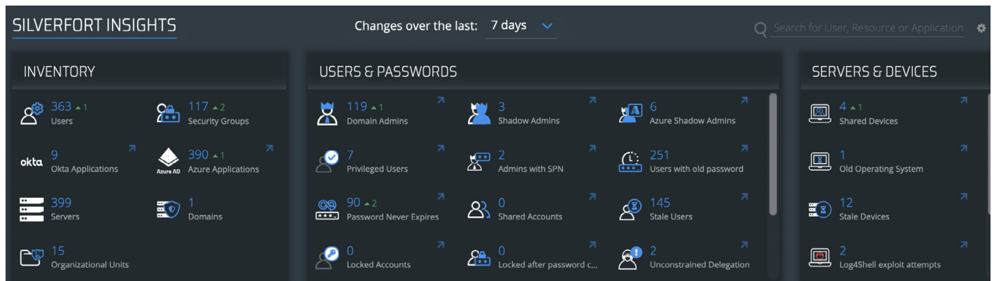
Silverfort's Insights screen offers insights into users, servers, applications, and devices protected by Silverfort.

Silverfort provides an identity inventory of your environment in the Insights screen of the console, including users, resources, risky users, and more.